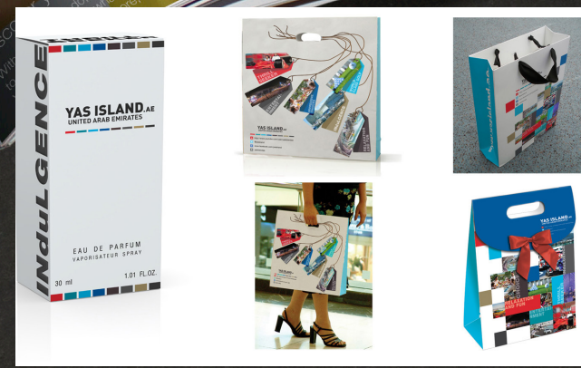
WHAT'S YOUR PERSONALITY? F1 & SEASON CAMPAIGN ATL & BTL Campaign for Yas Island